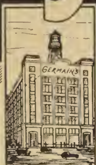
WHOLESALE DEPT. 747-49-51 TERMINAL ST.

A JOURNAL OF INFORMATION AND EDUCATION FOR PROGRESSIVE DEALERS